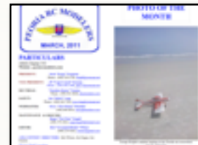
PRCM Monthly Newsletter