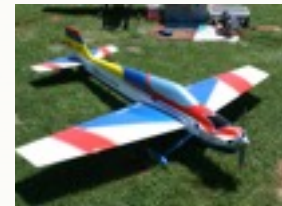
We have members that compete in pattern flying contests & pylon.

For calendar years 2008-2011, an annual assessment in the amount of $100 (in addition to the dues above) is required to finance the creation of and improvements to our new flying site.