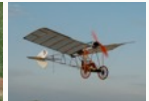
From the large and modern to the small and historical, we fly them all.